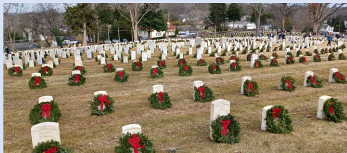
An amazing sight makes one recall Decoration Day