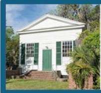
Edward Wallace Camp #21 Beaufort SC