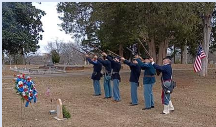
Firing the musket salute